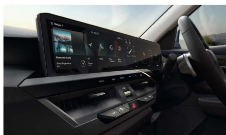
Panoramic Integrated Cluster