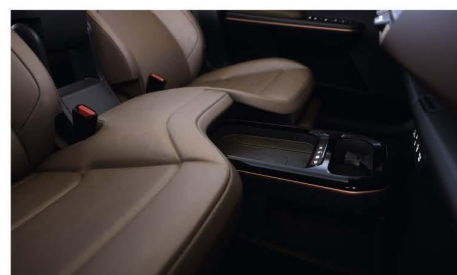
Bench-Type Front Seats with Adjustable Armrest