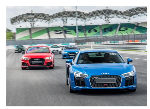
To discover more about the exclusive privileges that come with owning an Audi, visit www.myAudiworld.sg