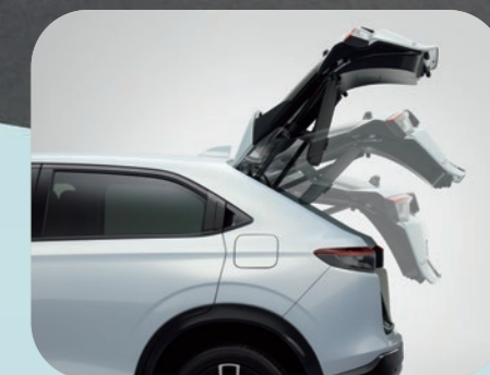
Hands-Free Power Tailgate* With the added convenience of a Walk-Away Close Button.