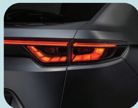
Rear LED Tail Lights with LED High Mount Stop Light Sleek curves, aerodynamic design.