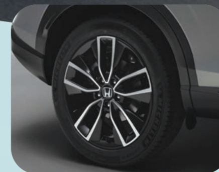
18" Alloy Wheels* Sporty rims that spell sophistication.