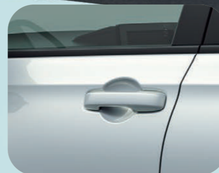
Smart Keyless Entry Seamless door handles with smart keyless entry and One-Push Start.