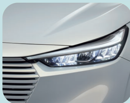
Auto LED Headlights and Daytime Running Lights Illumination for enhanced safety.

From the aerodynamic body that delivers both performance and fuel efficiency to the hands-free tailgate, this is the crossover SUV that integrates top-class aerodynamic performance and intelligent functions into its impressive design to give you a more exciting ride.