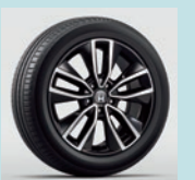
HR-V 1.5 HX e:HEV 18" Alloy Wheels

Specifications may vary from model(s) shown.