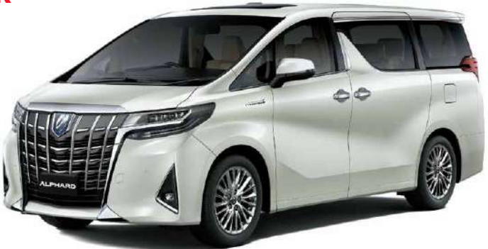
WHITE PEARL CS 070