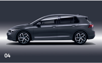
L RL GTI