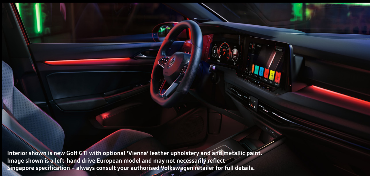
Interior shown is new Golf GTI with optional 'Vienna' leather upholstery and and metallic paint. Image shown is a left-hand drive European model and may not necessarily reflect Singapore specification – always consult your authorised Volkswagen retailer for full details.