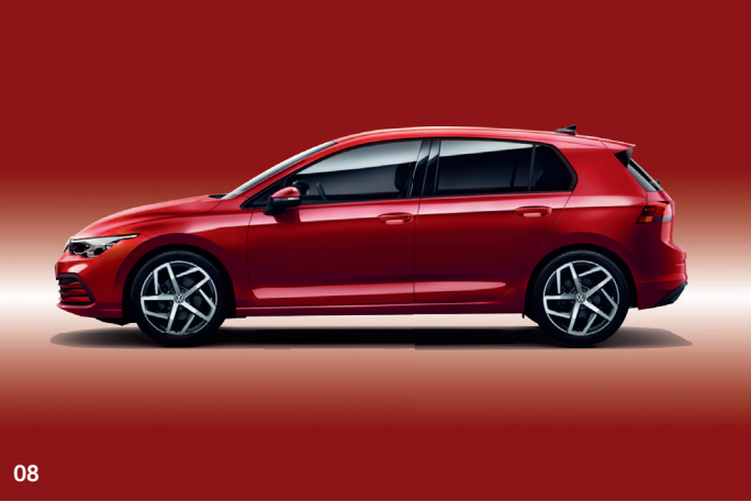
L RL GTI