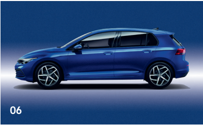
L RL GTI