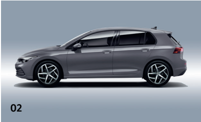
L RL GTI