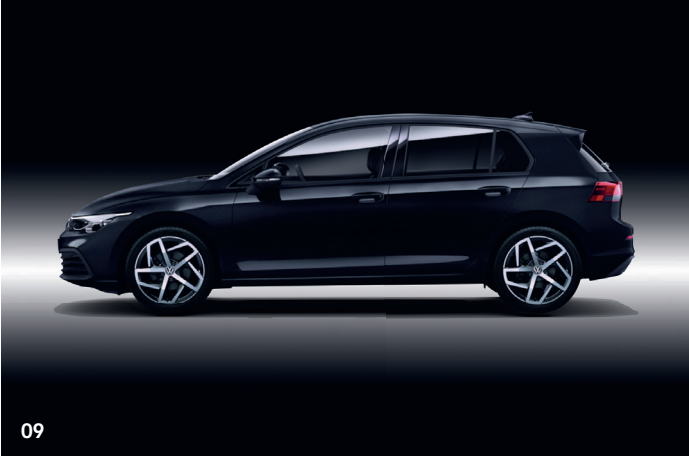
L RL GTI