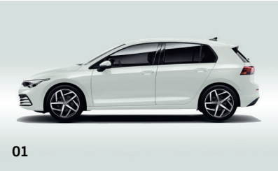
L RL GTI