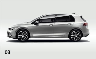
L RL GTI