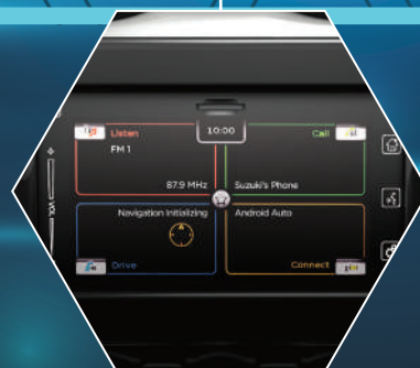
Bluetooth connectivity with Apple CarPlay® and Android Auto™