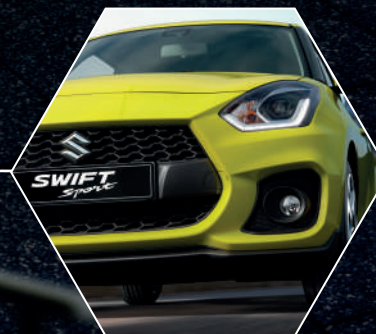
Sporty and bold front face