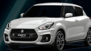
Pure White Pearl (ZVR)