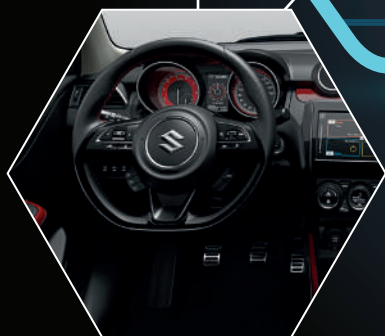
D-shaped steering wheel and stainless steel sport pedals