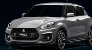
Premium Silver Metallic (ZNC)