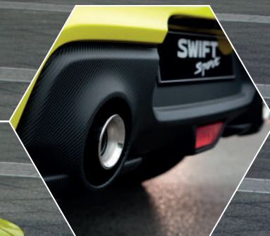
Dual exhaust pipes