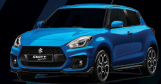
Speedy Blue Metallic (ZWG)