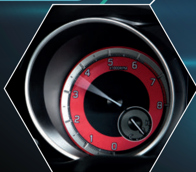
Redesigned meter cluster and 4.2" colour display