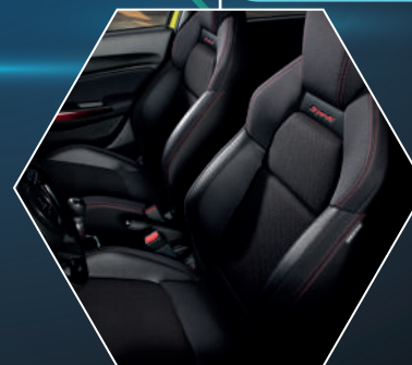
Exclusive semi-bucket seats with embossed "Sport" logo