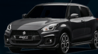
Super Black Pearl (ZMV)