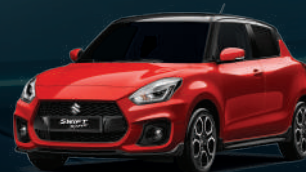
Burning Red Pearl Metallic x Super Black Pearl (D7Z)