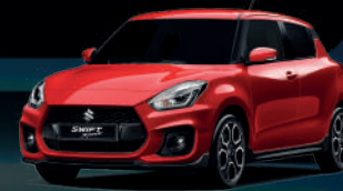
Burning Red Pearl Metallic (ZWP)