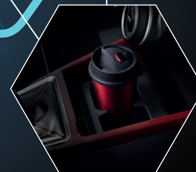
Sporty, red-accented driver-centric cabin