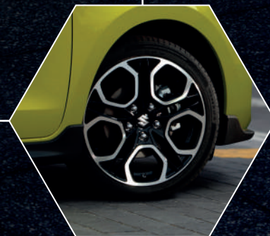
Finely crafted 17" alloy wheels