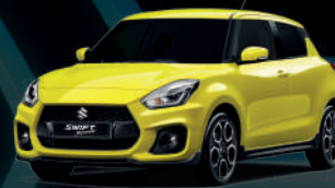
Champion Yellow (ZFT)