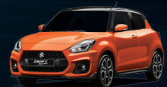
Flame Orange Pearl Metallic x Super Black Pearl (CFK)