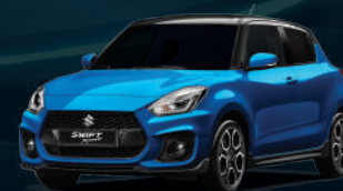
Speedy Blue Metallic x Super Black Pearl (C7R)