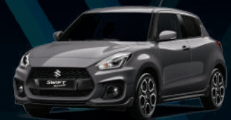
Mineral Gray Metallic (ZMW)