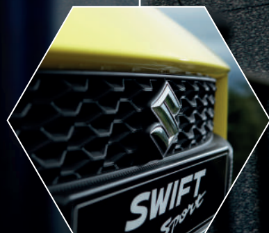
A striking front grille and bumper

It's time to take the training wheels off—both inside and out. The Swift Sport's distinctive exterior—featuring a striking new front grille, dual exhaust pipes and more—is complimented by a sporty, driver-focused interior, highlighted by the D-shaped steering wheel, stainless steel sport pedals and other great features. In other words, ultimate sportiness from every angle.