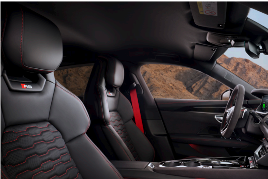
Split-folding rear seat backrest in 40/20/40