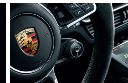
Sport Chrono Package