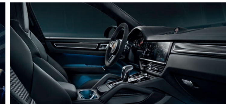
Porsche Communication Management (PCM) with full-HD 12-inch touchscreen display