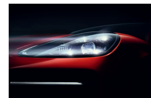
LED headlights with matrix beam including Porsche Dynamic Light System Plus (PDLS Plus)