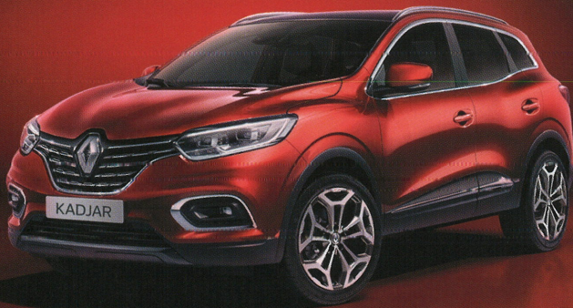
Flame Red (NNP) #