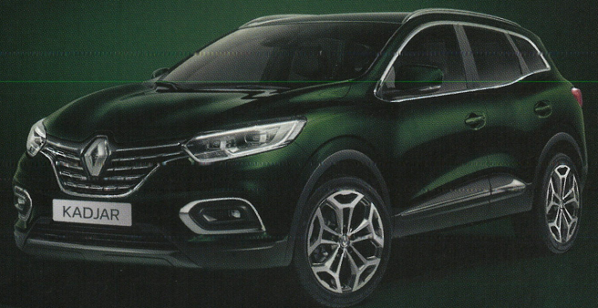
Oural Green (DPY) ^