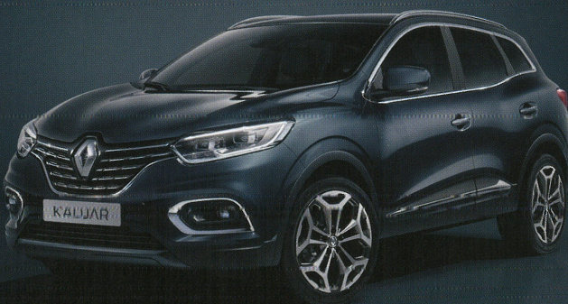
Titanium Grey (KPN) ^