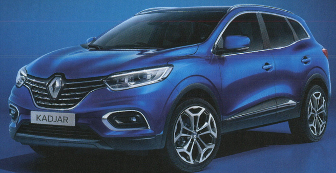
Iron Blue (RQH) ^