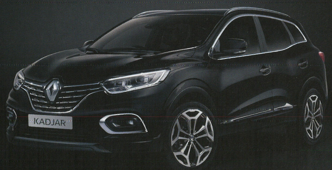
Diamond Black (GNE) ^