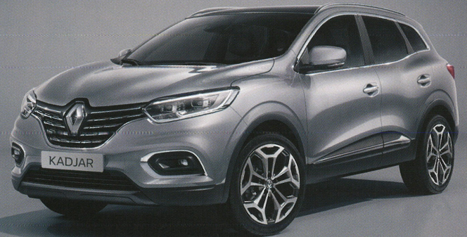
Highland Grey (KQA) ^