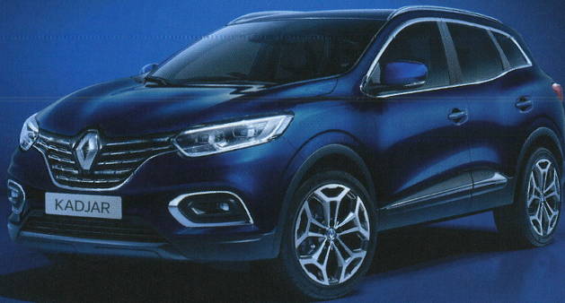
Cosmos Blue (RPR) ^