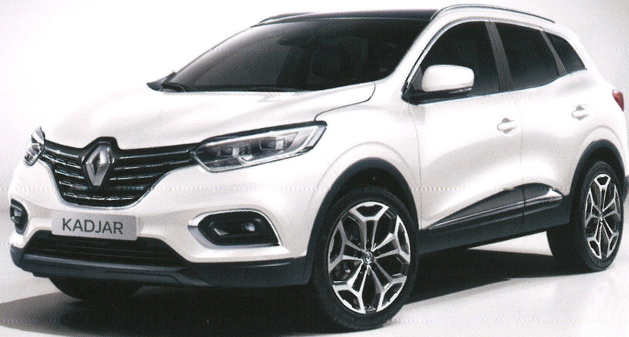
Pearl White (QNC) ^