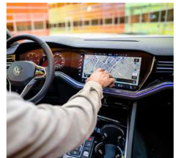
Images shown are for illustrative purposes only and may not necessarily reflect Singapore specifications.