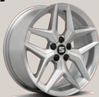
Dynamic 20/2 Fr Fp

Standard ■ Optional ■ Style /St/ FR /Fr/ Style Plus /Sp/ FR Plus /Fp/