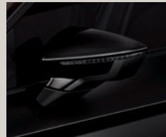
Midnight Black St Sp