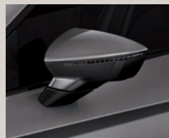
Pirineos Grey St Sp