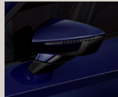
Mediterranean Blue St Sp