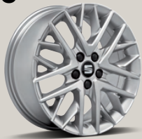
Design 20/1 St Sp