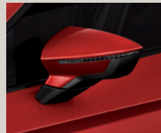
Desire Red St Sp