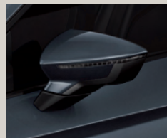
Magnetic Tech St Sp