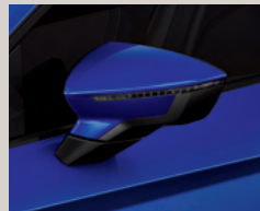
Mystery Blue St Sp