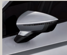
Urban Silver St Sp