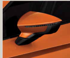
Eclipse Orange St Sp