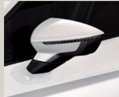
Candy White St Sp