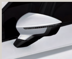
Nevada White St Sp