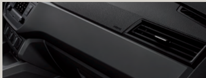
Cloth Orgad Grey / Ice Touch - CB St Sp