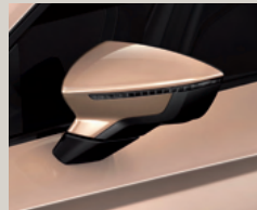
Mystic Magenta St Sp