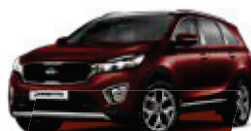
Sunset Red (MR5)