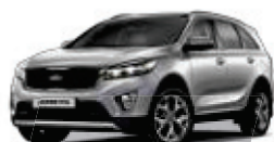
Silky Silver (4SS)