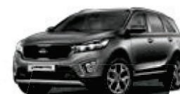
Metal Stream (MST)