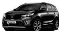
Platinum Graphite (ABT)