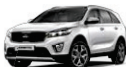
Snow White Pearl (SWP)