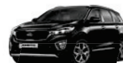
Aurora Black Pearl (ABP)