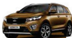
Imperial Bronze (MY3)